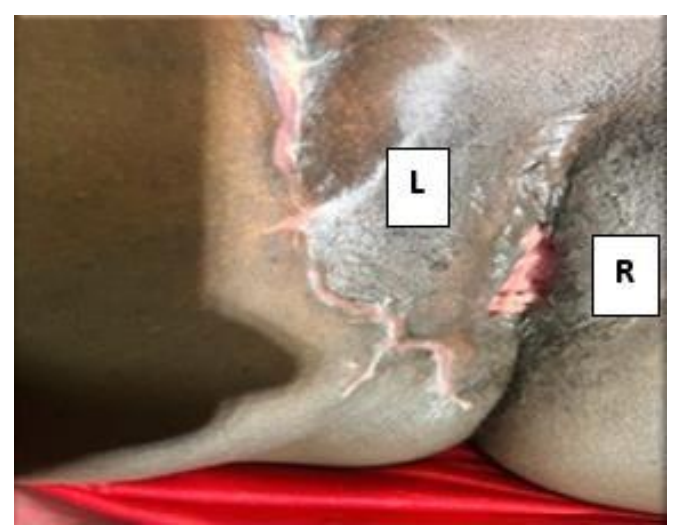
Figure 3: Two weeks postoperative picture of vulva after resection of angiomyxoma.

formation (Figure 3). As Somalia has no oncology center, getting chemo and radiotherapy treatments is quite expensive and the family could not afford the cost.