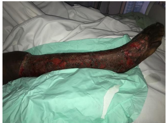
Figure 4. Figure showing the limb post-skin grafting

Check-up was done regularly for 10 months via teleconferencing as she lives remotely and was not been able to travel due to the COVID situation in the country. Within the 10 months, she did not complain of symptoms suggestive of disease recurrence and she reported that the results were aesthetically satisfactory. Through the calls, she also noted that she has since been able to resume her normal duties as a teacher.