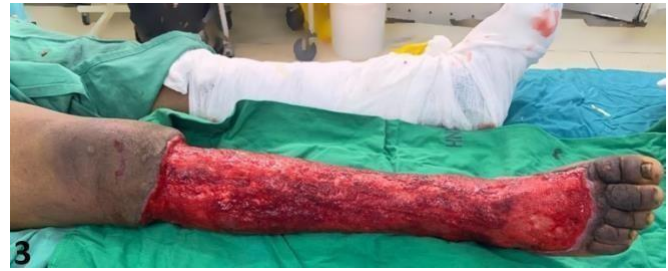
Figure 3. Figure showing the limb, post-operatively prior to skin grafting.

paracetamol for the remaining 12 days she was in the wards. She was able to ambulate after 7 days post-op and was discharged after 14 days.