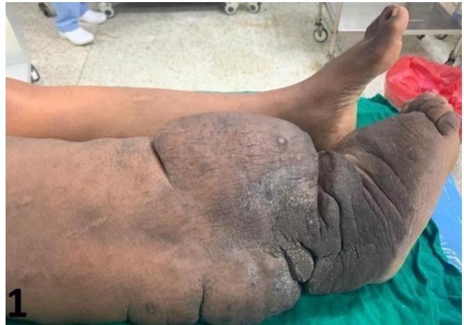
Figure 1: Figure showing the swollen affected limb pre-operatively.

Routine examination did not reveal any significant findings and despite being compliant, conservative management had failed to reduce the limb significantly.