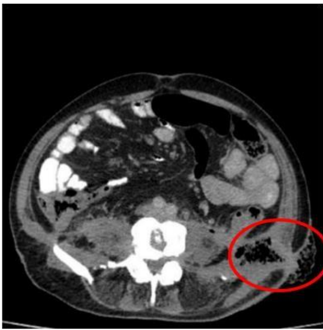
Figure 3. Fistulous tract from left colon with localized surrounding inflammatory changes (marked with a circle). The right side shows no obvious fistulous.

operatively. He was also put on IM morphine and IM ketorolac for analgesia. The recovery was uneventful, and he was discharged on the 6th post-operative day. His midline incision healed well with the debrided fistulae underwent serial wound care.