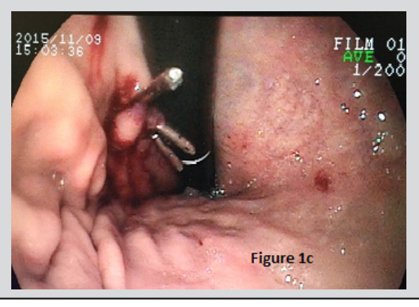
Figure 1a: Endoscopic View of Vascular Bleb Figure 1b: Hemostatic Clips on Lesion Figure 1c: Retroflexed View after Clip Application