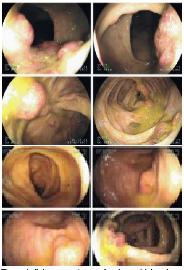
Figure 1: Colonoscopy images showing multiple polyps

divided doses for 1 day (40mg/kg/day). Using his weight of 60kilograms, Praziquantel dosage was calculated as 2400mg/day, given in two divided dosages (1200mg BID). Retreatment was done after four weeks using the same dosage. Scheduled clinic visits at eight weeks showed improvement of symptoms, with resolution of per rectal bleeding.