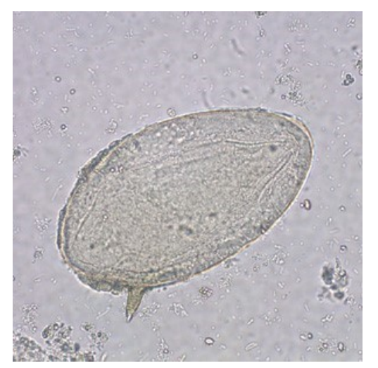
Figure 2 : Egg of Schistosoma mansoni with characteristic lateral spine